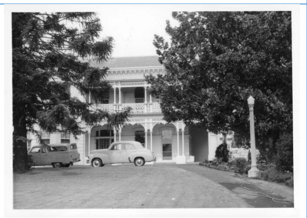
Front façade looking east, image dated 1963 (source: State Library Victoria, Collins, J.T., 1963. ["Larnook", formerly 13 Orrong Road, Armadale, now 519 Orrong Road] [picture]).