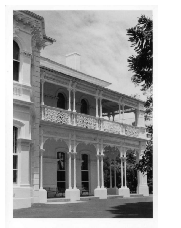
Front façade looking south east, image dated 1963 (source: State Library Victoria, Collins, J.T., 1963. ["Larnook", formerly 13 Orrong Road, Armadale, now 519 Orrong Road] [picture]).