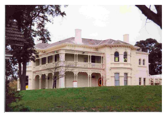
Photograph.

Heritage Group: Residential buildings Heritage Type: Mansion