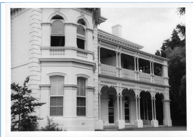
Front façade and western bay, looking south east in 1963 (source: State Library Victoria, Collins, J.T., 1963. ["Larnook", formerly 13 Orrong Road, Armadale, now 519 Orrong Road] [picture]).