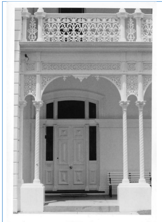
Entrance, image dated 1963 (source: State Library Victoria, Collins, J.T., 1963. ["Larnook", formerly 13 Orrong Road, Armadale, now 519 Orrong Road] [picture]).

The building is not readily visible from the street. As a result, historical images of the place have been included below to provide context.