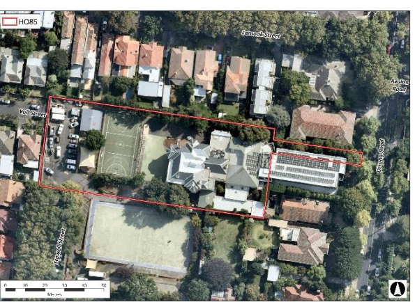
Location map and extent of HO85.

Heritage Group: Residential buildings Heritage Type: Mansion