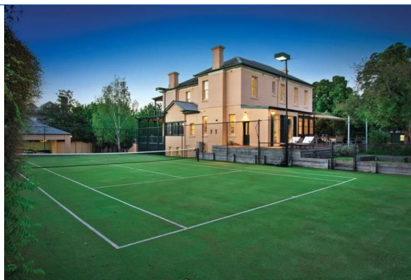
Southern and rear elevation (source: www.domain.com.au , 2014).