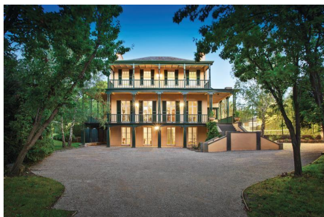
Photograph of Hampden Villa.