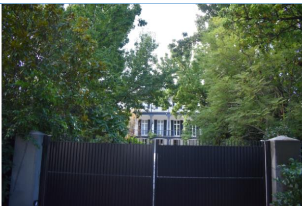
View of residence from the street (source: Extent Heritage Pty Ltd, 2021).