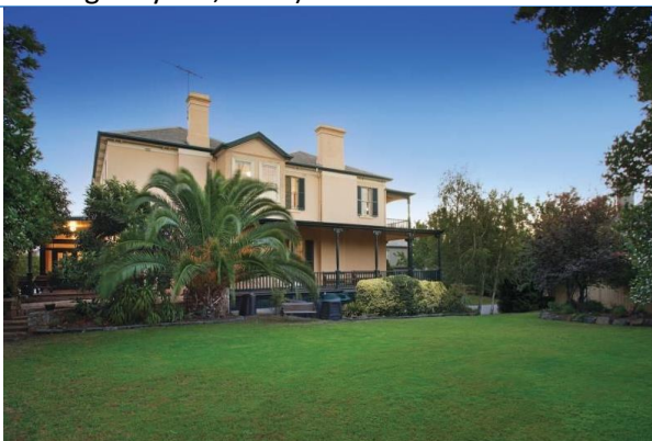
Northern elevation (source: www.domain.com.au , 2014).