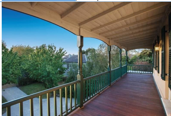
Detail of balcony timber joinery.