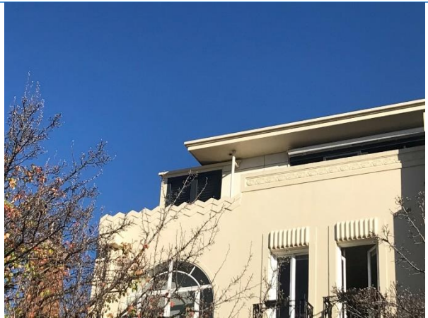
Parapet detailing on western elevation, showing the contemporary fourth floor addition.