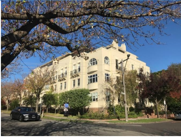
Corner of Trawalla Court, looking south east (source: Extent Heritage, 2021).