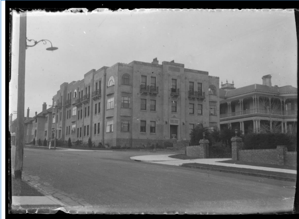
Trawalla Court, not long after construction was completed (source: Ettelson, P. E. W. (1929). [Residential apartment building of three stories, flat roof, on corner] [picture]).