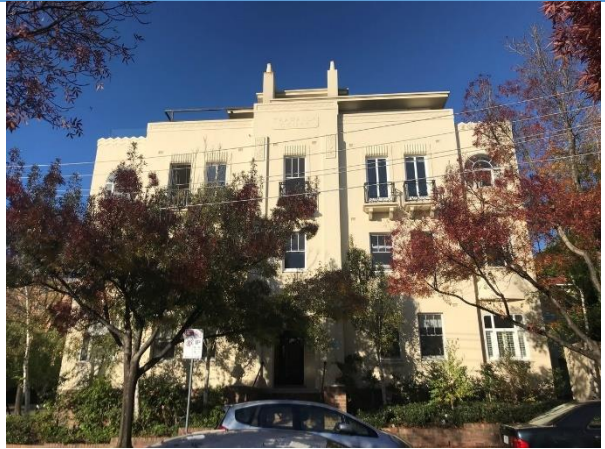
Western elevation.