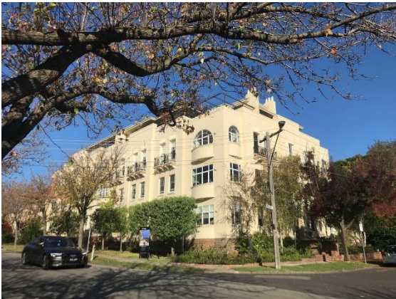
Photograph of Trawalla Court (source: Extent Heritage, 2021).

Designer: Gordon J. Sutherland Builder: Unknown