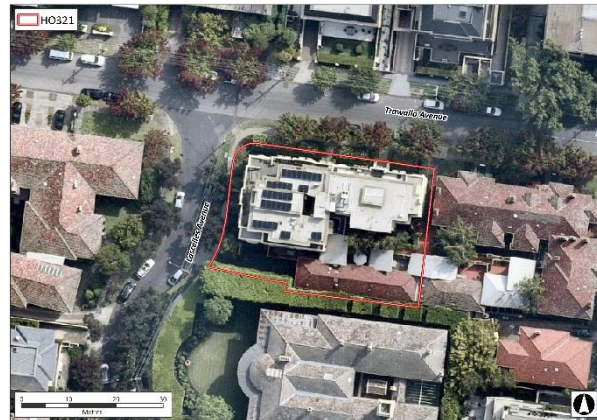
Location map and extent of HO321.

Heritage Group: Residential buildings Heritage Type: Flats