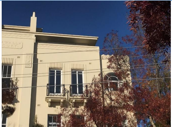
Parapet detailing on south western corner.