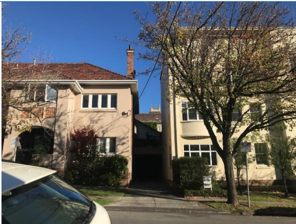
Lane separating No. 24 from 14 Orrong Road (source: Extent Heritage, 2021).