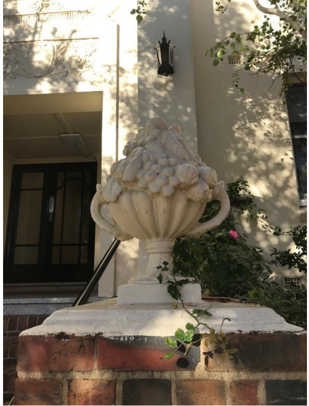
Intact urns on western elevation stair (source: Extent Heritage, 2021).