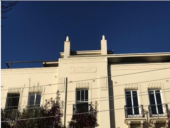
Detail of the western elevation showing the building name (source: Extent Heritage, 2021).