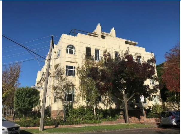
Western elevation of Trawalla Court.