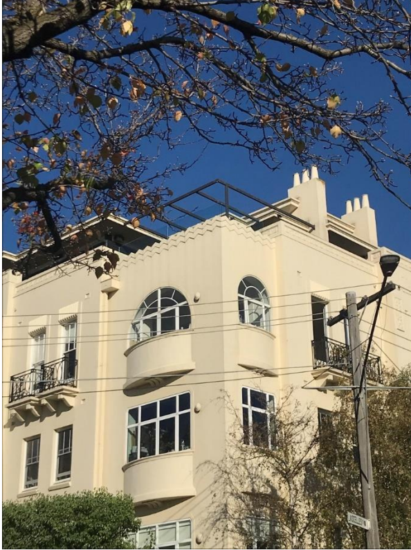
Detail view of north western corner (source: Extent Heritage, 2021).