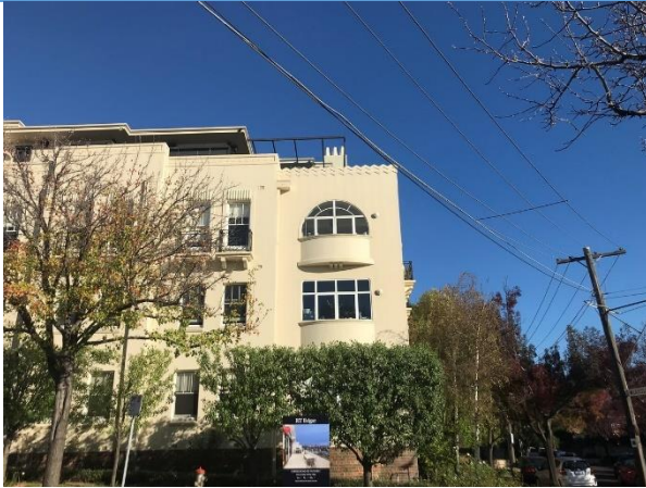
Detail of windows on north western corner.