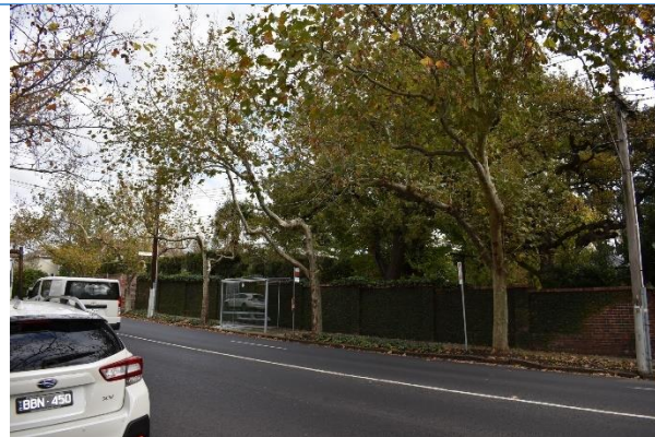
Mature English oak ( Quercus robur ), visible from Orrong Road.