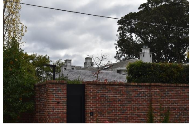
Roof forms visible from Orrong Road.