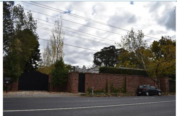
Boundary wall and entrance gate, visible from Orrong Road (source: Extent Heritage Pty Ltd, 2021).