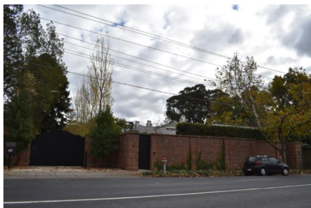
Photograph of Miegunyah.