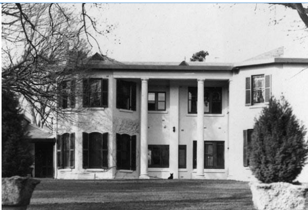
The northern elevation of Miegunyah, dated to 1933 (source: University of Melbourne, 1933).

The residence is not readily visible from Orrong Road. As a result, historical images have been included to assist with contextualising the property.