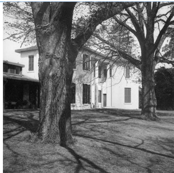
Oblique view of the northern elevation of Miegunyah, dated to 1933.