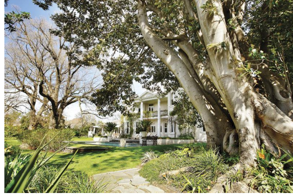
Mature plantings and landscaping in front of the northern elevation of Miegunyah (source: www.realestateview.com.au , 2009). Source: RealestateView.