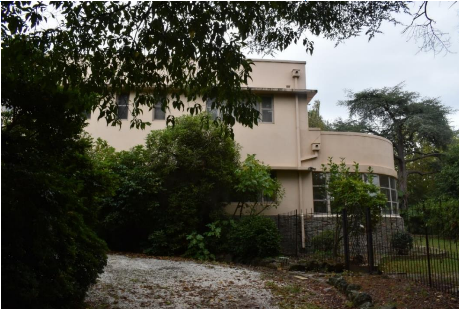
Streamline projecting bay on the northern elevation, as viewed from Lansell Road looking west (source: Extent Heritage Pty Ltd, 2021).