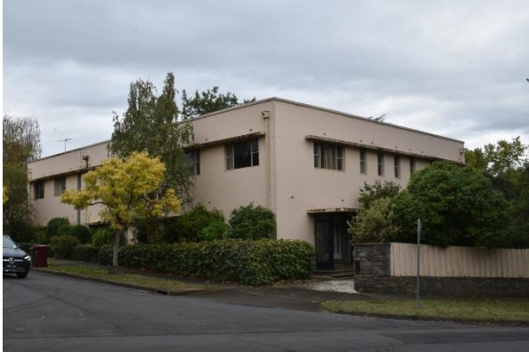
South eastern corner, looking north west (source: Extent Heritage Pty Ltd, 2021).