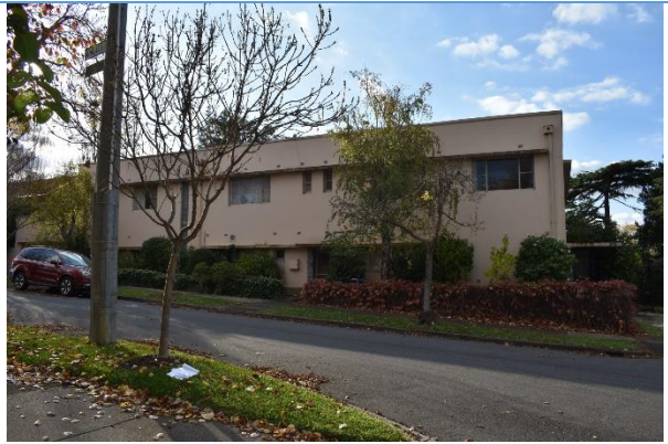
Southern elevation, looking north west (source: Extent Heritage Pty Ltd, 2021).