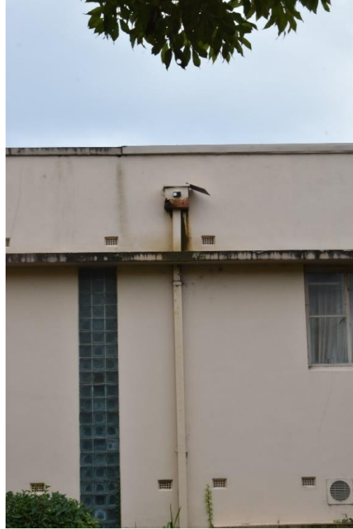
Vertical glass brick window design.