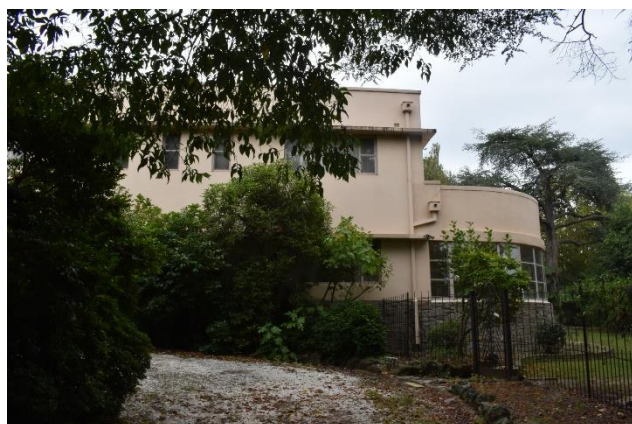
Photograph of 55 Lansell Road.