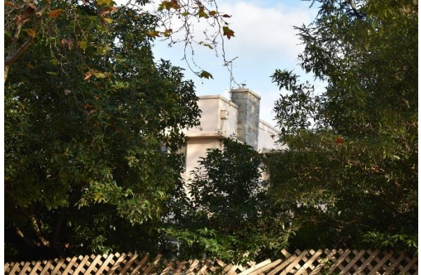
Stone chimney on northern elevation (source: Extent Heritage Pty Ltd, 2021).