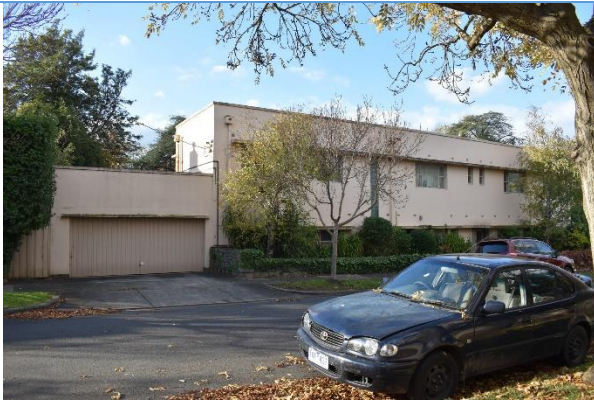
Southern elevation, looking north (source: Extent Heritage Pty Ltd, 2021).