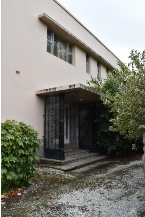
Entrance, eastern façade (source: Extent Heritage Pty Ltd, 2021).