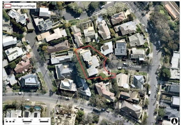
Location and map extent of 2 Theodore Court, Toorak.

Heritage Group: Residential buildings Heritage Type: Flat