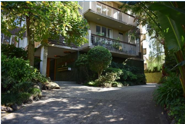
Detail view of the front entrance and lower level units (source: Extent Heritage Pty Ltd, 2021).