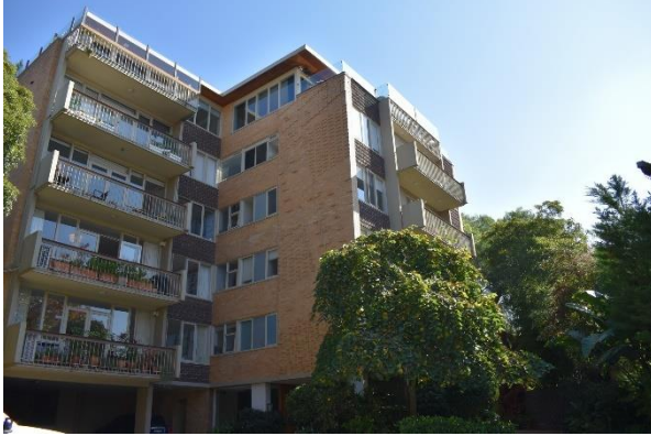
North-west facing view of Heyington Gardens.