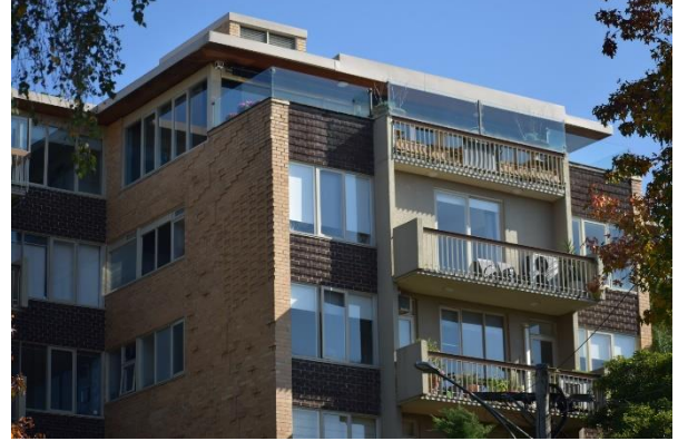
Detail view of upper level units (source: Extent Heritage Pty Ltd, 2021).