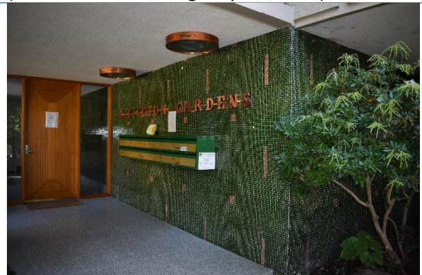
Detail view of the front entrance, altered to include green, white and bronze coloured tiling, expressed lettering and terrazzo flooring.