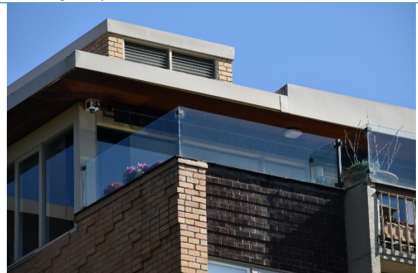
Detail view of altered upper level units with glass balustrades and varnished timber boxed eaves (source: Extent Heritage Pty Ltd, 2021).