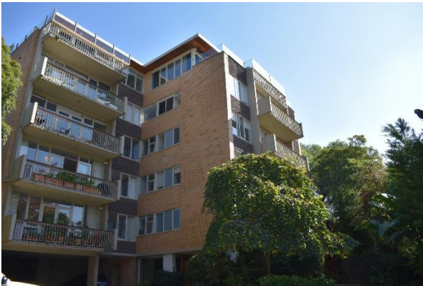
Photograph of 2 Theodore Court (source: Extent Heritage, 2021).

Designer: Dr. Ernest Fooks Builder: Unknown