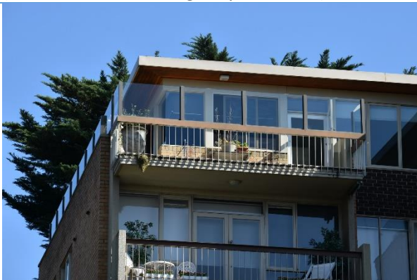
Detail view of altered upper level units with glass balustrades and varnished timber boxed eaves.