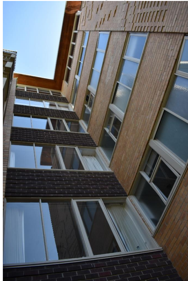
Detail view of fenestration.