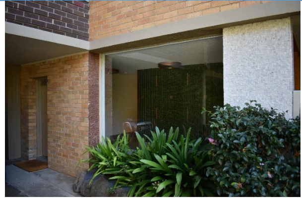
North-west facing view of the front entrance (source: Extent heritage Pty Ltd, 2021).