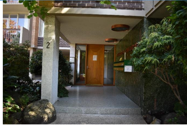
Detail of the front entrance and main entrance door.