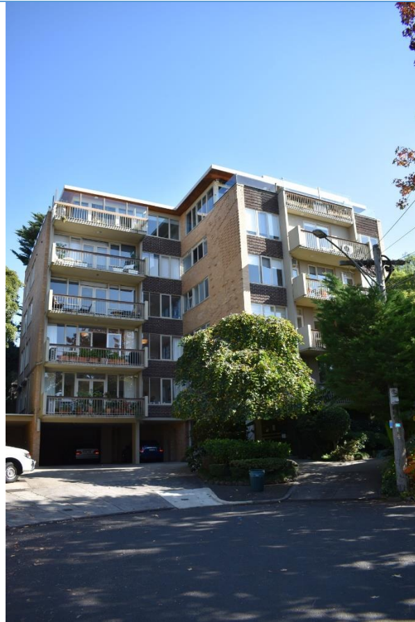
West facing view of Heyington Gardens from Theodore Court, Toorak (source: Extent Heritage Pty Ltd, 2021).