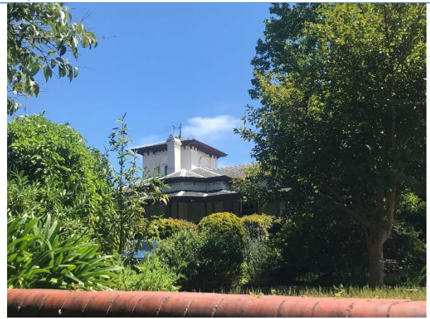
View of the tower from Lansell Road (source: Extent Heritage Pty Ltd, 2021).