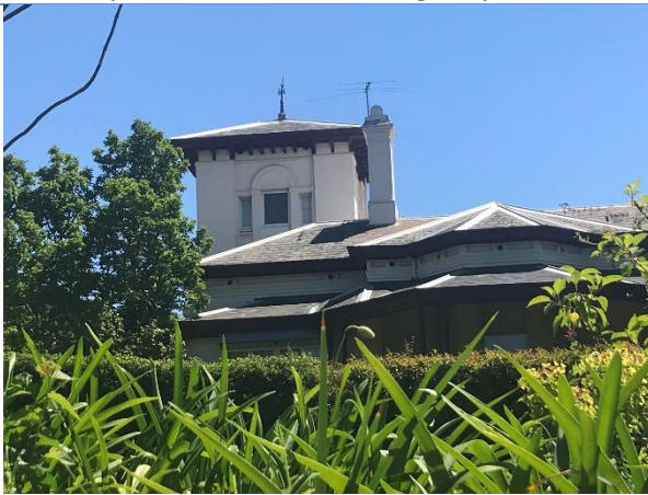
Detail of the tower and roof form.