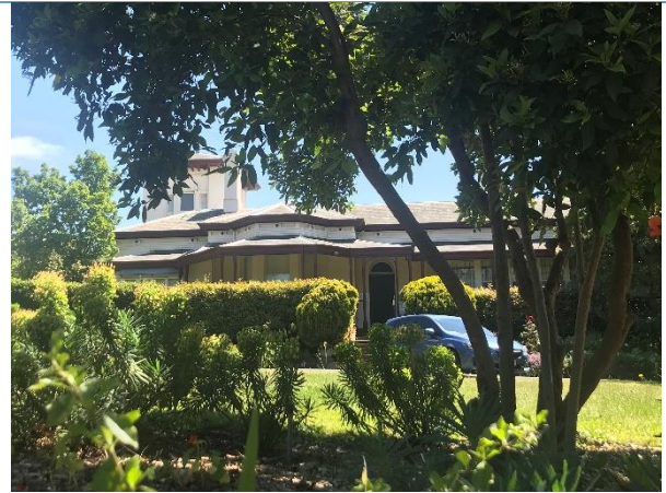
View from Lansell Road (source: Extent Heritage Pty Ltd, 2021).