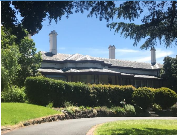
View from the entrance of the residence and driveway (source: Extent Heritage Pty Ltd, 2021).