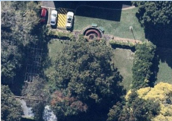
Aerial view of mature white oak planting and formal garden situated to the south.