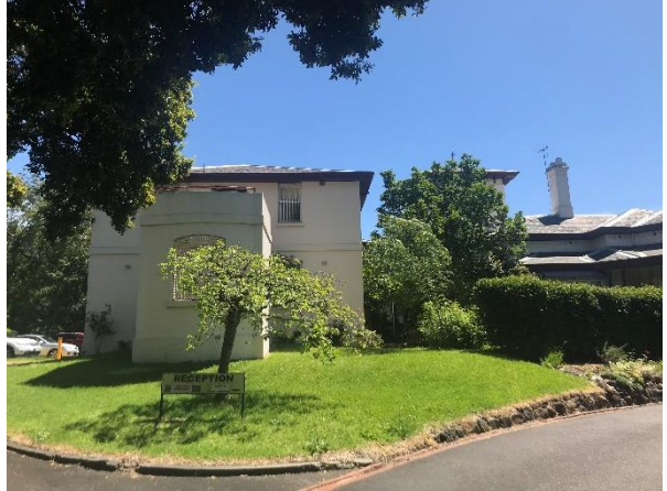
Two-storey south wing extension added in 1968 (source: Extent Heritage Pty Ltd, 2021).