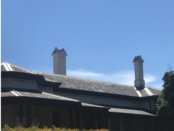
Detail of the chimneys.