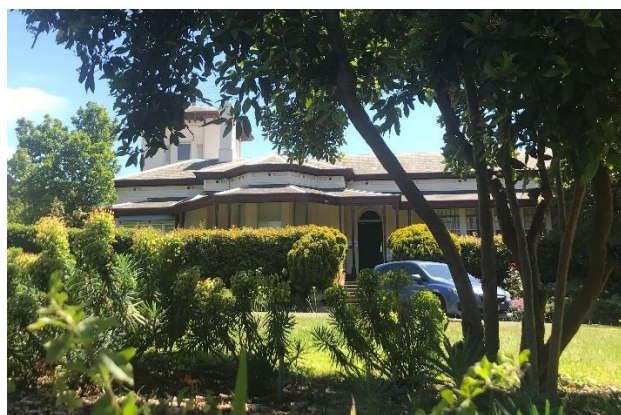
Photograph of Umina.