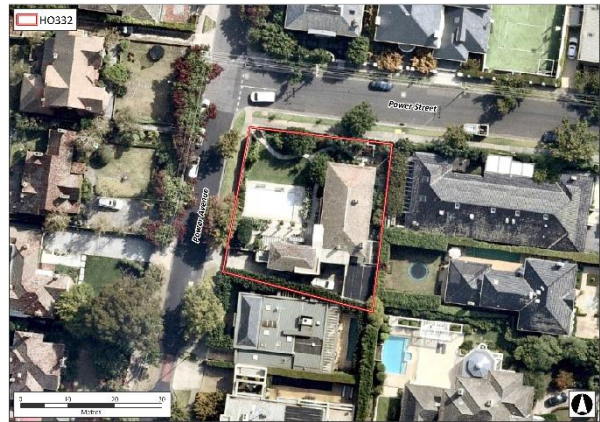
Location map and extent of HO332.