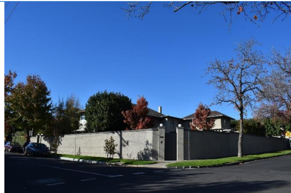
View from the intersection.