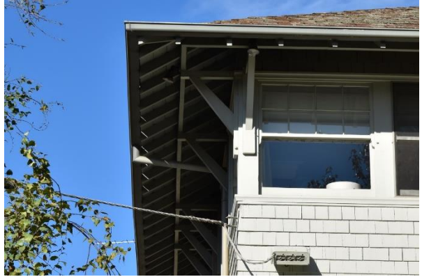
Detail view of eaves and brackets (source: Extent Heritage Pty Ltd, 2021).