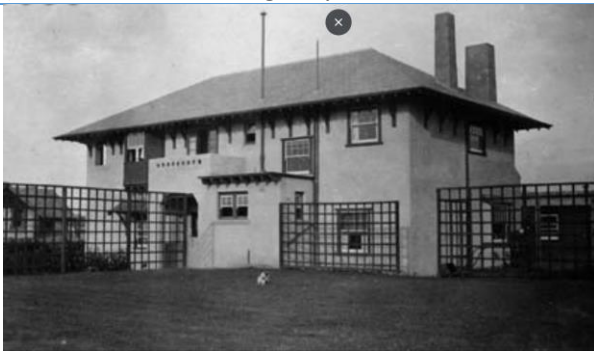
Early photograph of Avalon fronting Power Avenue. c. 1916 (source: Unknown. c. 1916. 'Avalon', Power Avenue Toorak. Photograph. Image collection, ref no. MP7265. Stonnington History Centre collection).