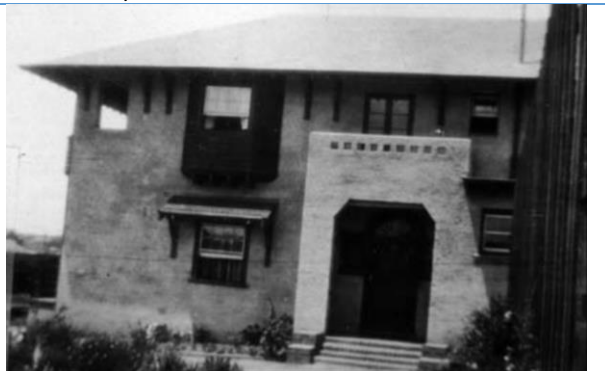
Early photograph of Avalon fronting Power Avenue. c. 1916 (source: Unknown. c. 1916. 'Avalon', Power Avenue Toorak. Photograph. Image collection, ref no. MP7267. Stonnington History Centre collection).