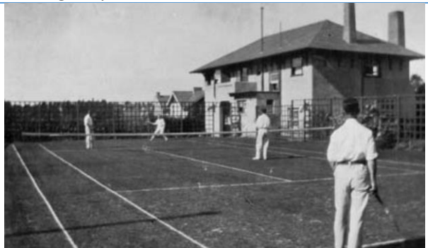
Photograph of tennis court at Avalon following alterations in 1925. Note: the source is dated c1916 but this seems to be incorrect (source: Unknown. c. 1916. Tennis being played on the court at 'Avalon'. Photograph. Image collection, ref no. MP7283. Stonnington History Centre collection).