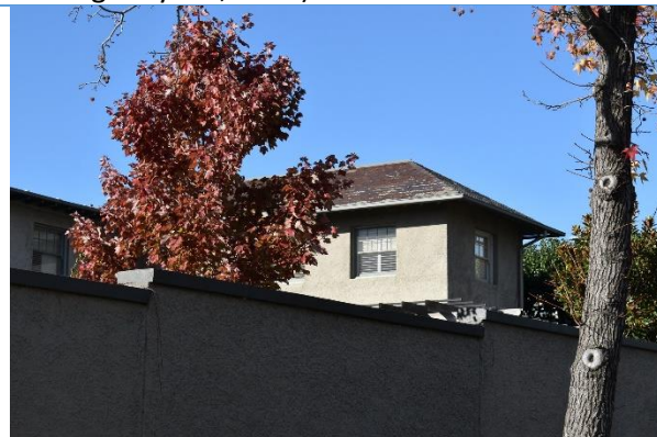
Later southern extension, looking south east.