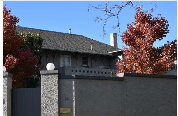
Front façade, looking southeast.