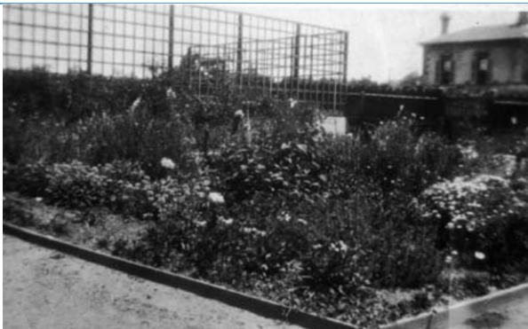
Early photograph of landscaped garden at Avalon. c.1916 (source: Unknown. c. 1916. Garden at 'Avalon'. Photograph. Image collection, ref no. MP7266. Stonnington History Centre collection).