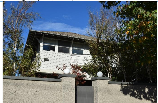
Northern elevation, looking south.