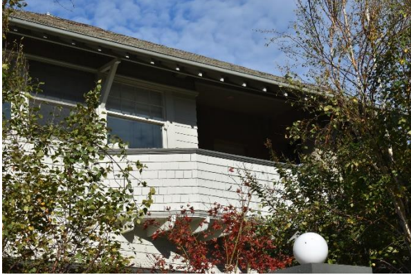
Balcony on northern elevation looking south west (source: Extent Heritage Pty Ltd, 2021).