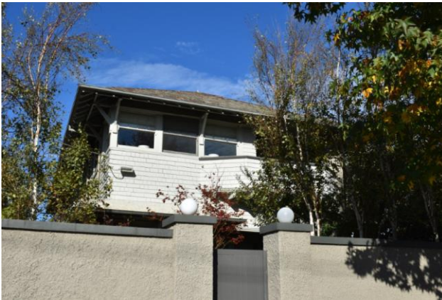
Photograph of Avalon.