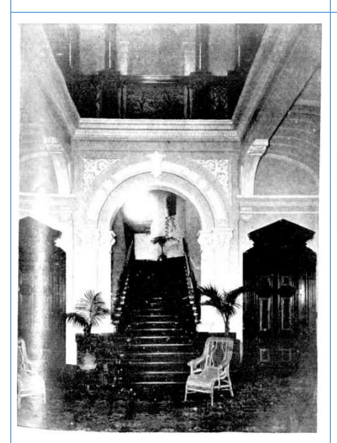
THE VESTIBULE, "OMA."