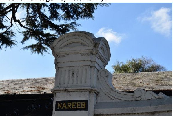
Detail of pier capping and nameplate (source: Extent Heritage Pty Ltd, 2021).