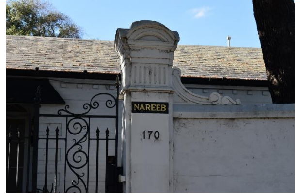
Detail view of the southern gate pier.