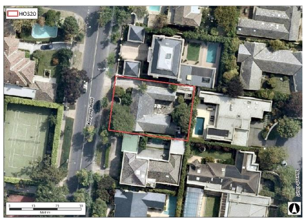
Location map and extent of HO320.