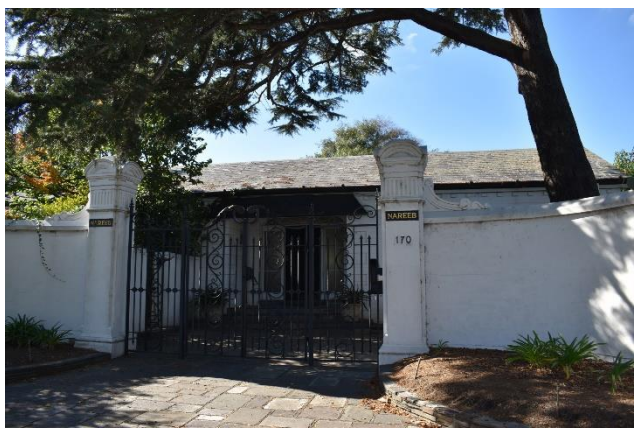
Photograph of Former Oma Gateway (source: Extent Heritage Pty Ltd, 2021).