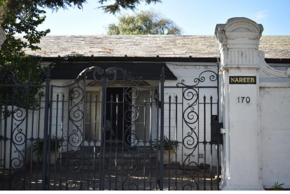
Detail view of the non-original gates.