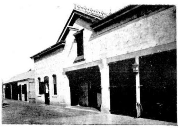
Extensive Two-storey Brick Stabling.