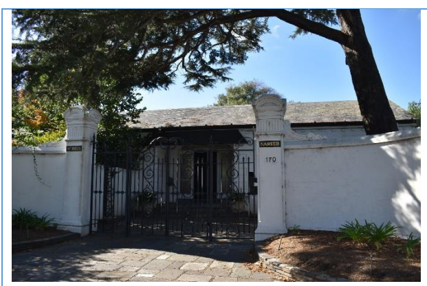
The existing gateway, gates and tree (source: Extent Heritage Pty Ltd, 2021).