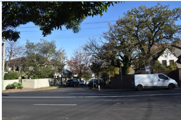
View of 679 and 681 Orrong Road, Toorak and entrance to Montalto Avenue.