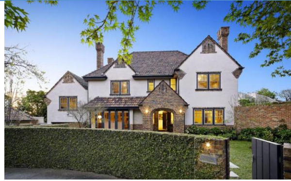
10 Montalto Avenue, Armadale. (source:www.realestate.com).