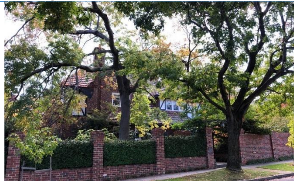
32 Montalto Avenue, Toorak