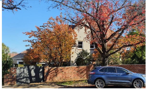
16 Montalto Avenue, Toorak