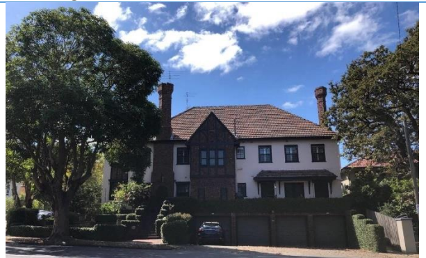
692 Orrong Road, Toorak.