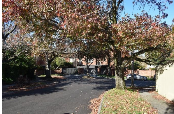
View along 2-5 Montalto Avenue, showing the street trees.