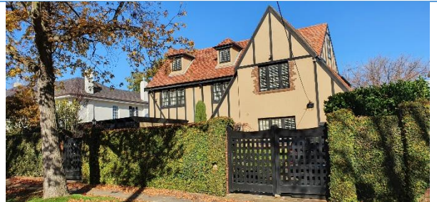
18 Montalto Avenue, Toorak (source: City of Stonnington, 2020).