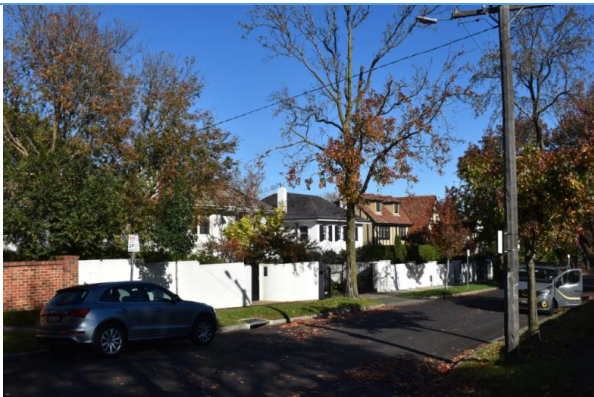
View along 21-19 Montalto Avenue, Toorak.