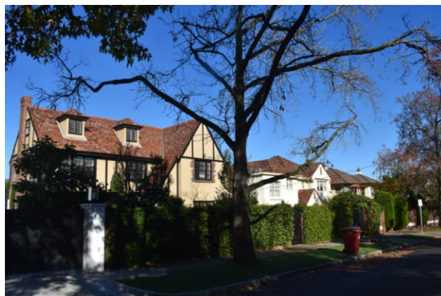
Photograph of view along 17-19 Montalto Avenue (source: Extent Heritage, 2021).