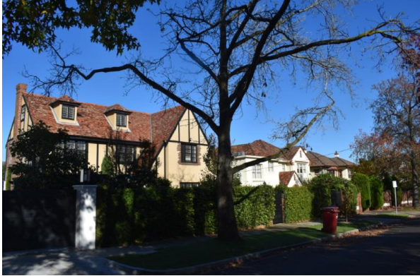
View along 17-19 Montalto Avenue, Toorak.