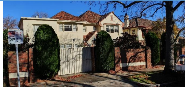
18 Montalto Avenue, Toorak.