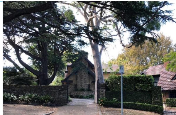
6 Stonehaven Court, Toorak which contains early plantings.