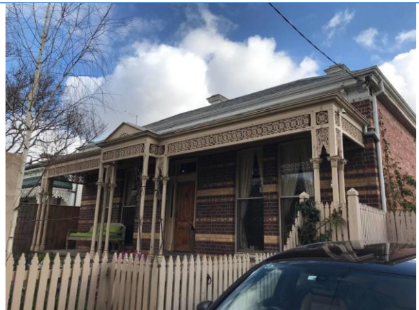
9 Auburn Grove, Armadale.