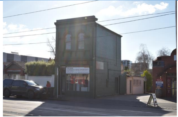
811 High Street, Armadale.