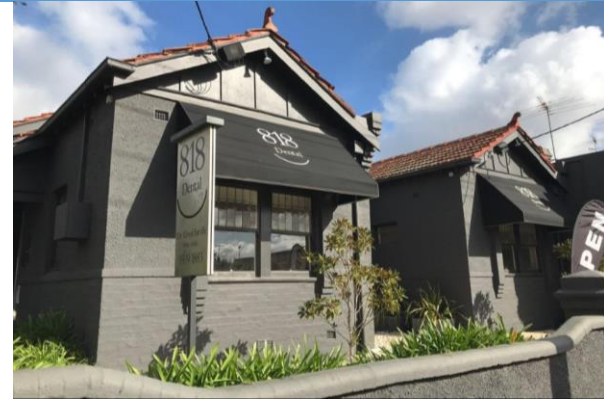
816-818 High Street, Armadale.