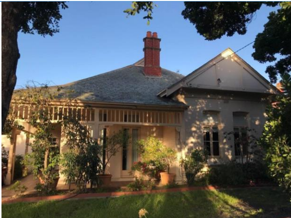
4 Auburn Grove, Armadale (source: City of Stonnington, 2020).