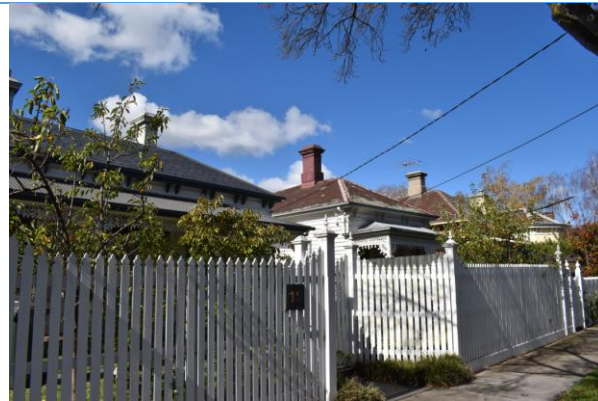
View along Auburn Grove showing a row of matching Victorian era dwellings (source: Extent Heritage Pty Ltd, 2021).