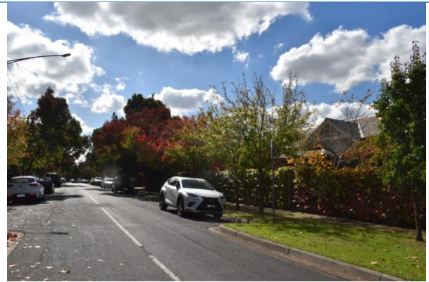
View looking north east along Auburn Grove (source: Extent Heritage Pty Ltd, 2021).