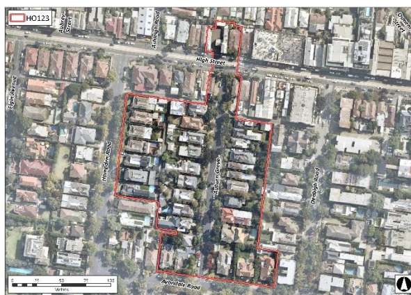
Location map and extent of HO123.

Heritage Group: Residential buildings Heritage Type: Residential precinct