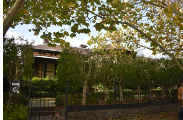
5 Hampden Road, Armadale (source: Extent Heritage Pty Ltd, 2021).