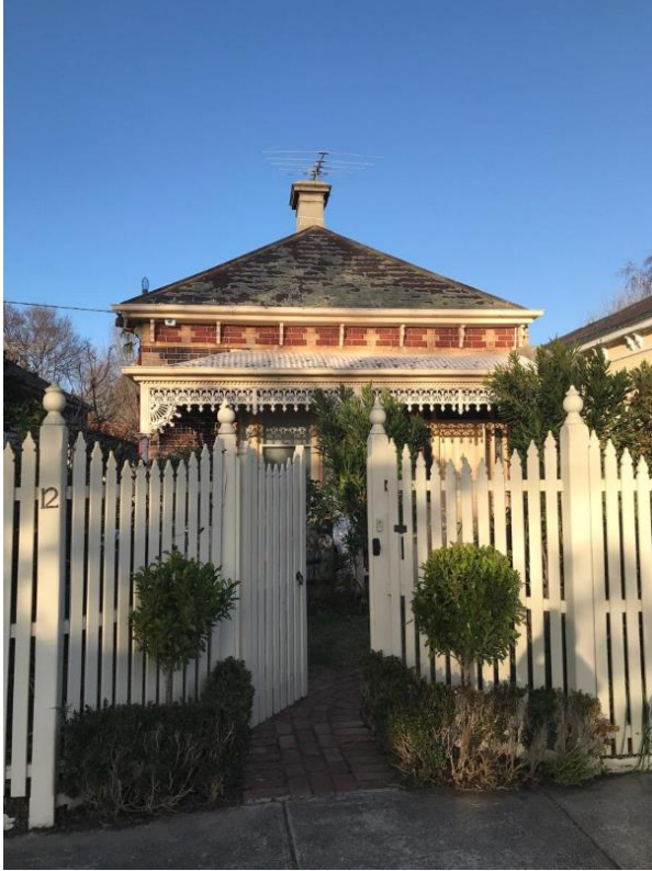
12 Auburn Grove, Armadale.