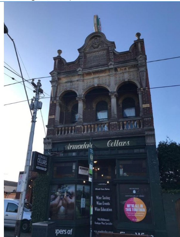
817 High Street, Armadale (source: City of Stonnington, 2020).