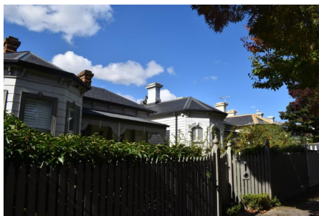
Photograph of 20-22 Auburn Grove, Armadale.