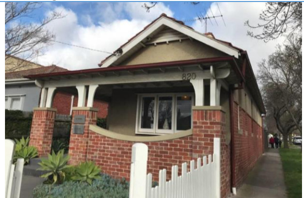
820 High Street, Armadale.