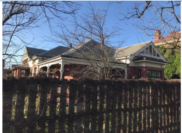
13 Avondale Road, Armadale (source: City of Stonnington, 2020).