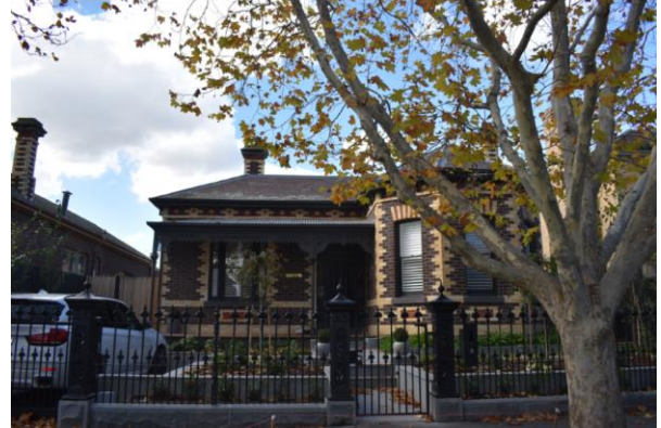
9 Hampden Road, Armadale.