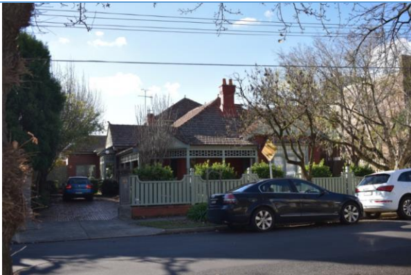
17 Avondale Road, Armadale (source: Extent Heritage Pty Ltd, 2021).