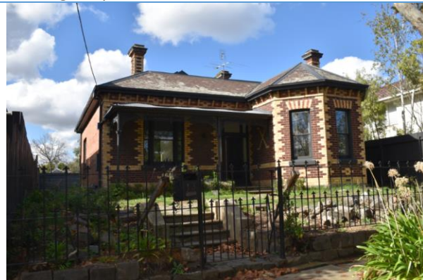
13 Hampden Road, Armadale.