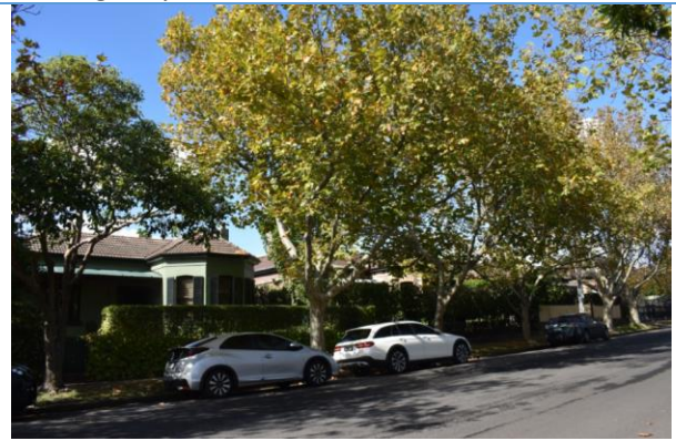
View along Hampden Road, looking south east (source: Extent Heritage Pty Ltd, 2021).