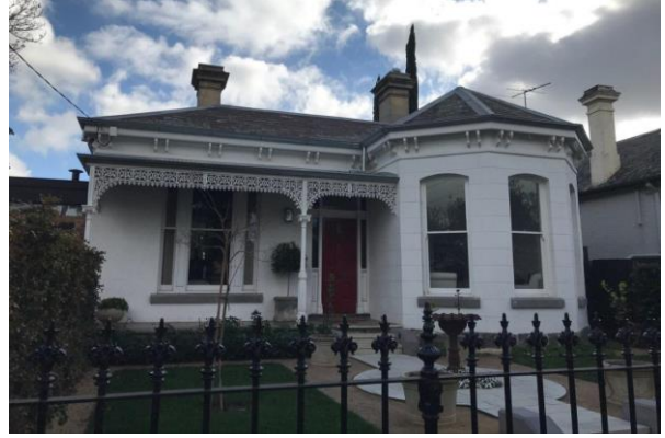
1A Auburn Grove, Armadale (source: City of Stonnington, 2020).