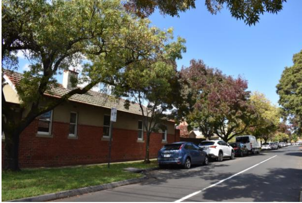
View looking south east along Auburn Grove (source: Extent Heritage Pty Ltd, 2021).