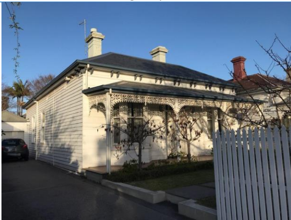
16 Auburn Grove, Armadale (source: City of Stonnington, 2020).