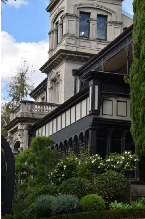
Detail view of northern verandah.