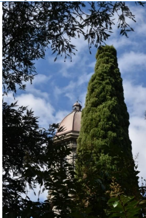
Detail view of tower dome.