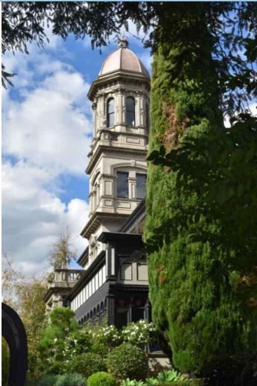
Northern elevation of dwelling (source: Extent Heritage Pty Ltd, 2021).