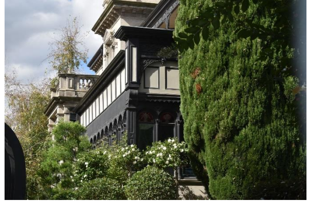
Detail view of northern verandah and plantings.