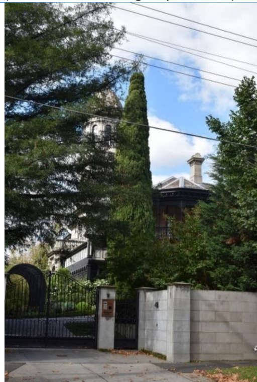
Dwelling viewed from Orrong Road.