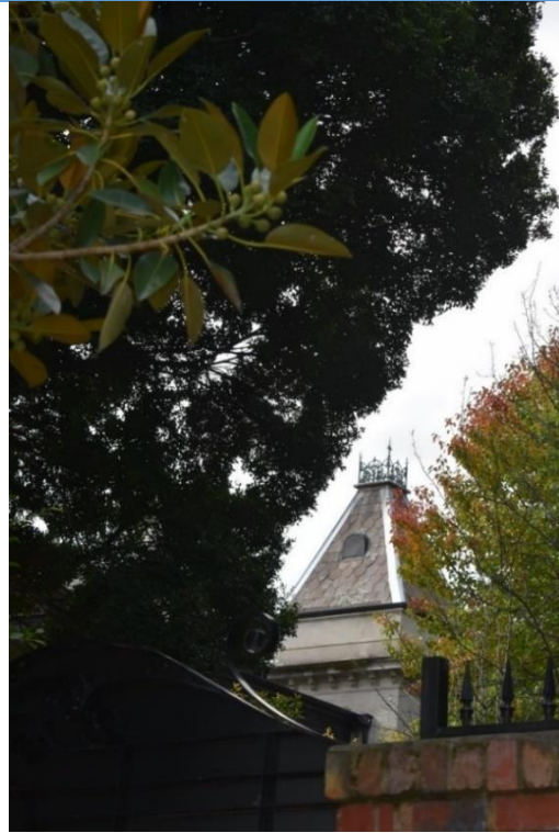
Detail view of southern tower (source: Extent Heritage Pty Ltd, 2021).