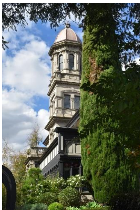
Photograph of Former Sebrof House (source: Extent Heritage Pty Ltd, 2021).