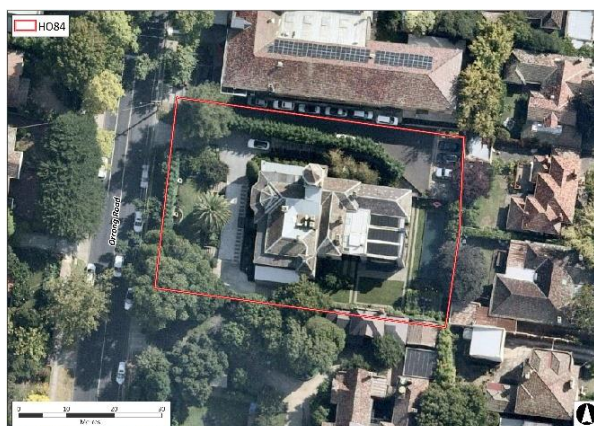
Location map and extent of HO84.

Heritage Group: Residential buildings Heritage Type: Mansion