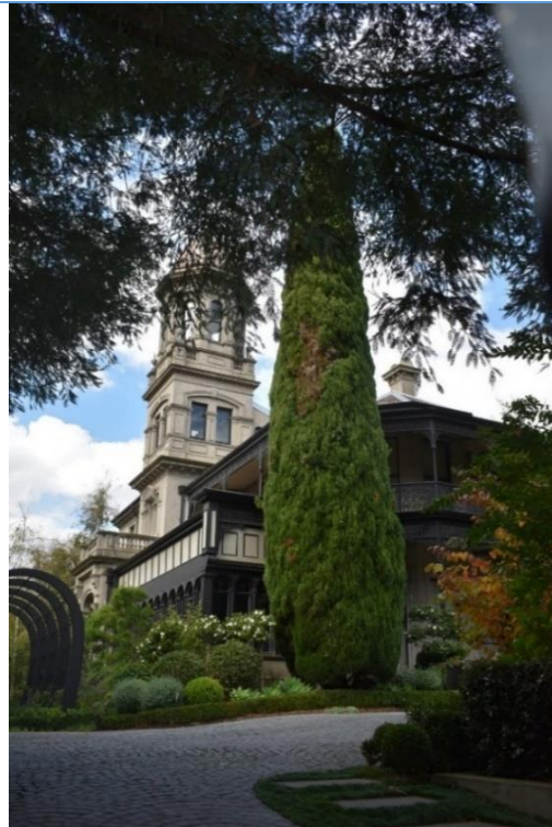
North western corner of residence (source: Extent Heritage Pty Ltd, 2021).