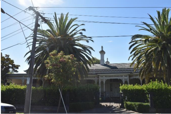
Flete plantings, looking north west (source: Extent Heritage Pty Ltd, 2021).