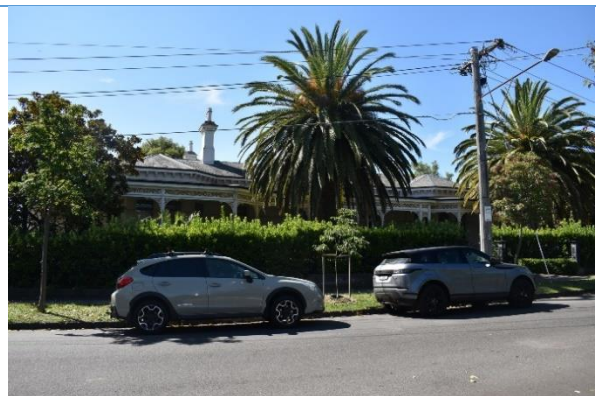
Southern elevation of Flete, looking north.