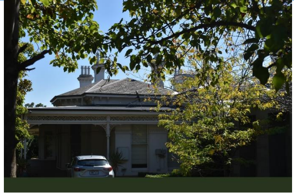
Eastern elevation of Flete (source: Extent Heritage Pty Ltd, 2021).