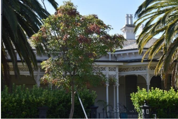
Façade details on Flete.