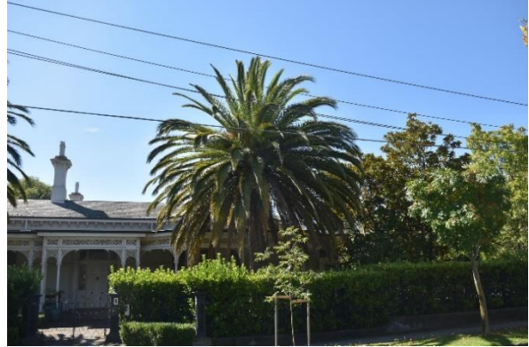
Flete plantings, southern elevation (source: Extent Heritage Pty Ltd, 2021).