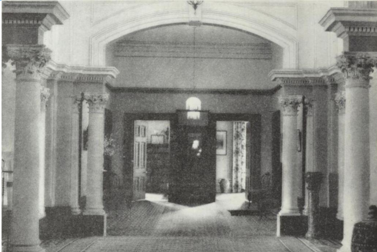
Interior of Flete.