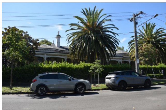
Photograph of Flete.