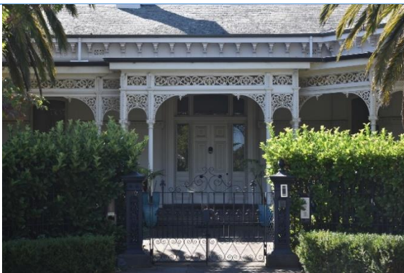
Flete's façade, southern elevation (source: Extent Heritage Pty Ltd, 2021).